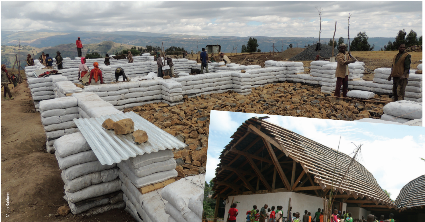
TOP: Earth bags—bags filled with soil—provide the insulation for Adisge Primary School's walls and help regulate temperatures inside classrooms that could otherwise become chilly. RIGHT: A curved building design helps encourage air flow at Ilima Conservation Primary School, making sure children can stay focused on learning rather than the hot temperatures outside.