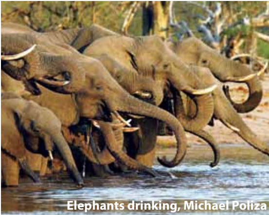
Elephants drinking

E mbark on an exclusive safari experience accompanied by an AWF scientist to some of Southern Africa's most remarkable wildlife reserves. Begin in the Lower Zambezi, a landscape within one of AWF's Heartlands, where land conservation and elephant conservation are two top priorities for AWF staff and researchers. Next, visit magnificent Victoria Falls where game drives and active adventures await you. Your final wildlife destinations are the Okavango Delta, whose mazelike waterways provide a rich habitat for a host of predators and prey, and the Kruger National Park, where game drives and cultural experiences provide a fitting end to your Southern Africa safari.