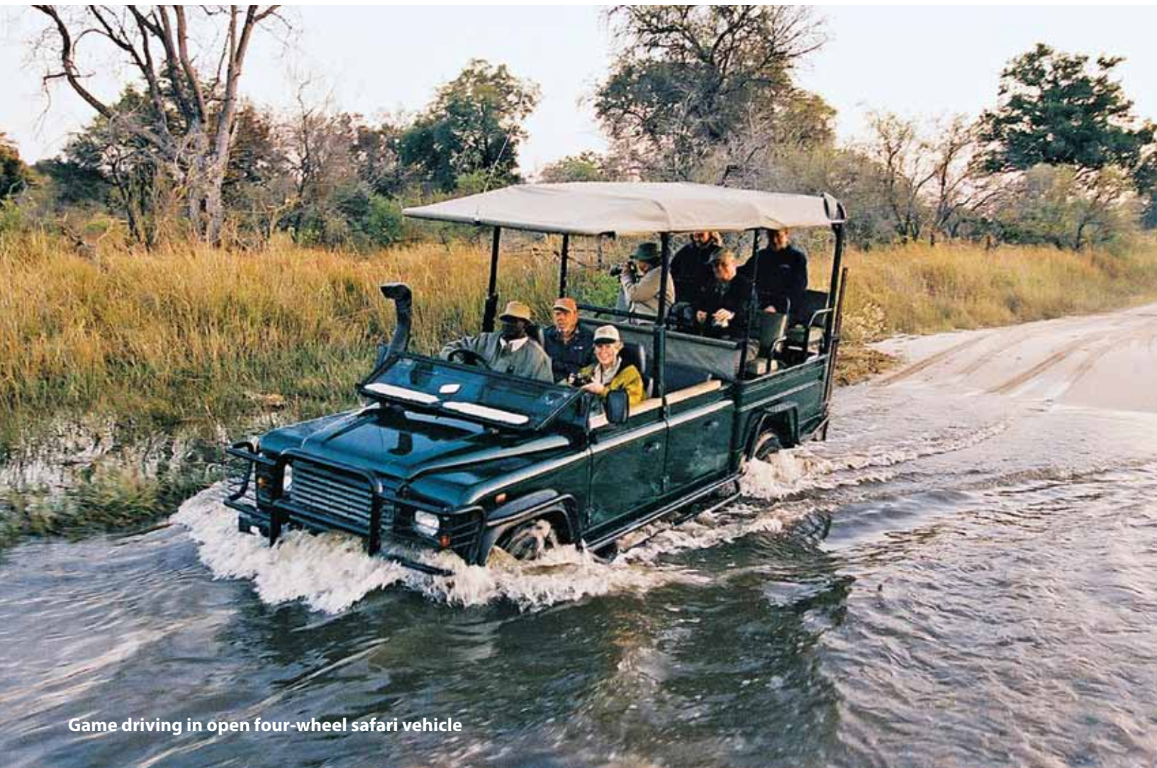
Game driving in open four-wheel safari vehicle

E mbark on an exclusive safari experience accompanied by an AWF scientist to some of Southern Africa's most remarkable wildlife reserves. Begin in the Lower Zambezi, a landscape within one of AWF's Heartlands, where land conservation and elephant conservation are two top priorities for AWF staff and researchers. Next, visit magnificent Victoria Falls where game drives and active adventures await you. Your final wildlife destinations are the Okavango Delta, whose mazelike waterways provide a rich habitat for a host of predators and prey, and the Kruger National Park, where game drives and cultural experiences provide a fitting end to your Southern Africa safari.