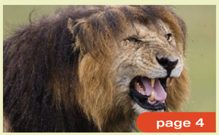
The Nature's Best Photography competition shows just why it's worth saving Africa's wildlife.

Poaching and illegal wildlife trafficking has brought forest elephants to the edge of extinction.