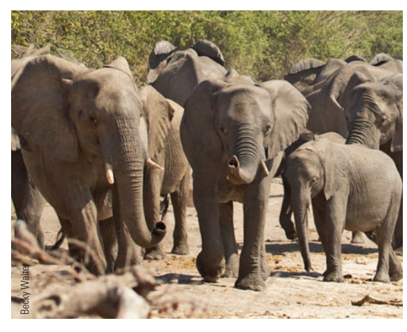
Access to education is a powerful motivator for rural communities. In Kazungula, for example, the Sekute community set aside 20,000 hectares of land for an elephant corridor in exchange for a new primary school.

MASS is currently drafting a manual that provides guidelines around the building of an ACS school. AWF has, meanwhile, begun discussions with potential partners in the areas of curriculum development and technology.