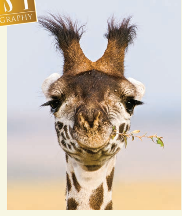
Masai Giraffe ▲ Masai Mara National Reserve, Kenya

"I was driving slowly through the forest of Nakuru National Park, searching for the resident leopard typically seen there. Instead, I noticed a huge black rhino climbing the hill in my direction. The rhino came straight toward me, unaware of my presence, giving me the chance for an unexpected series of photographs at close range."