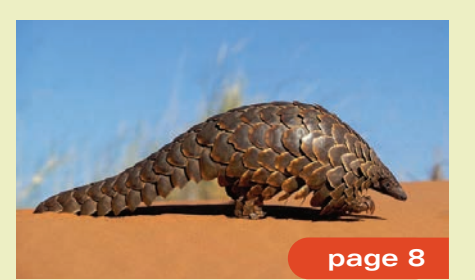
Discover the mysterious Pangolin, a truly unique species.