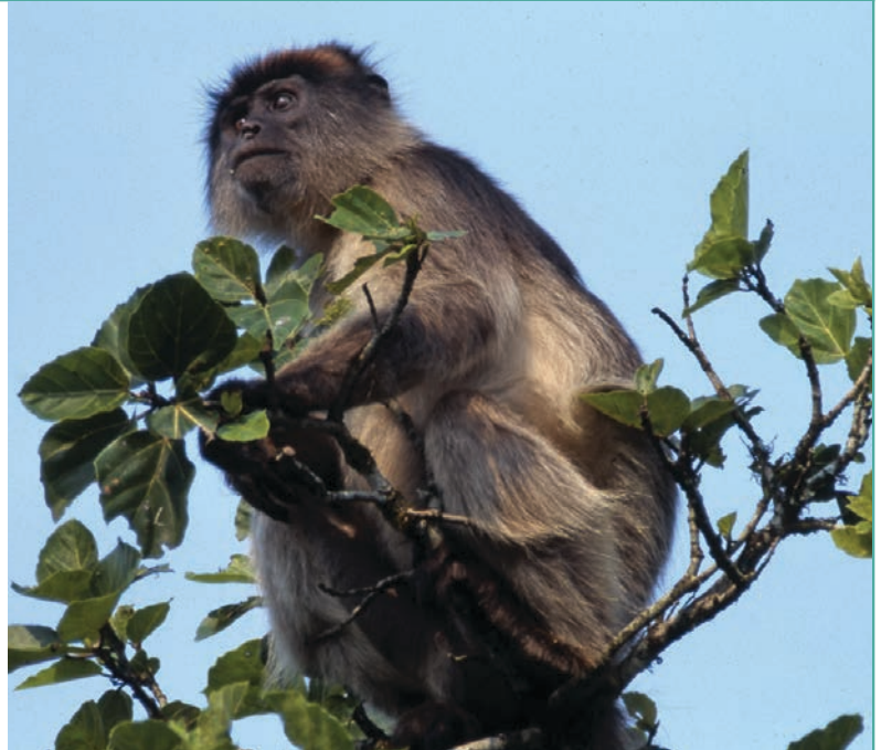
Craig R. Sholley

Not much is known about the colobus beyond its tendency to travel in large family groups of about 15 to 80 members. Most groups contain two or more males, with females spending a majority of their time grooming others within the group. With population estimates hovering around 500—due in large part to an 80 percent decrease over the past 30 years—the Niger Delta red colobus faces environmental pressures from deforestation, crude oil harvest, the bushmeat trade, and a lack of government protection, with its swampy habitat bearing the brunt of massive oil spills and logging incursions. The species was recently listed in The World's Top 25 Most Endangered Primates by the International Union for Conservation of Nature.