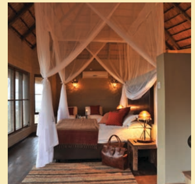
Ngoma Safari Lodge

Northern Botswana’s Chobe National Park is home to a large concentration of wildlife, but it is too small to support its animal residents. This gives elephants, buffalo, and other wildlife no other option but to spill over into community areas. AWF brokered a partnership between a private safari operator and the community to build Ngoma Safari Lodge, a high-end lodge that offers local residents employment and revenue in return for setting aside a portion of their land for conservation. ■