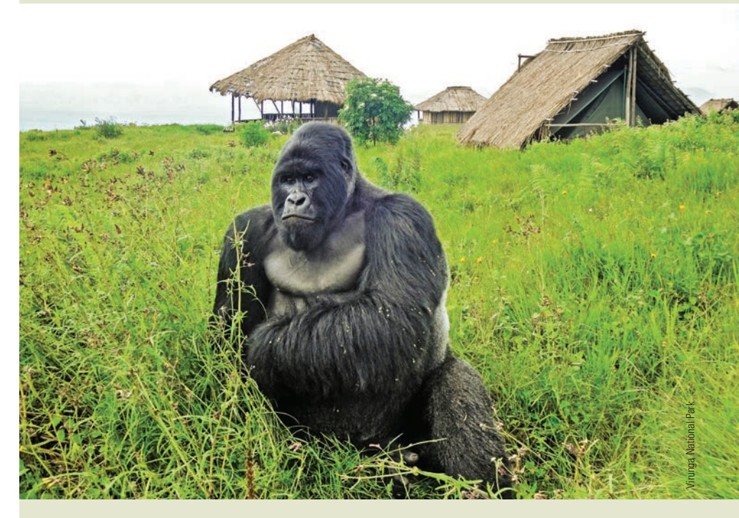
Rebel presence in Virunga National Park and the resulting insecurity in the region have prevented rangers from being able to conduct regular monitoring of the mountain gorillas.