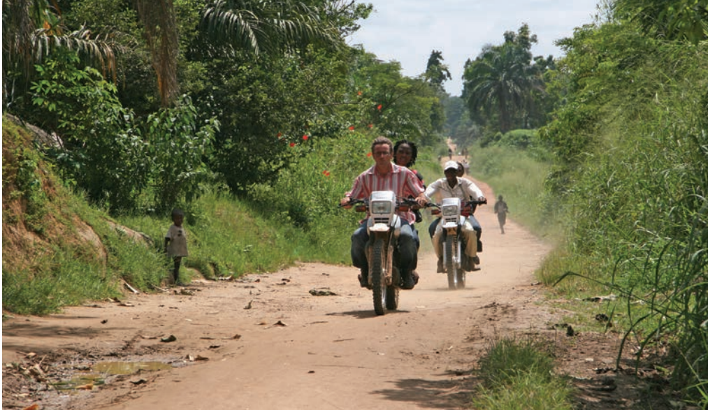
The Democratic Republic of Congo—which suffers from poor infrastructure, such as incomplete roadways, as above, and political instability—is one location where AWF's conservation efforts are a challenge.

As the Lomako research program takes off and as more sections of the forest come under official protection (see our cover story), however, AWF will play an important role in helping to develop infrastructure and create economic opportunities where currently there are none.