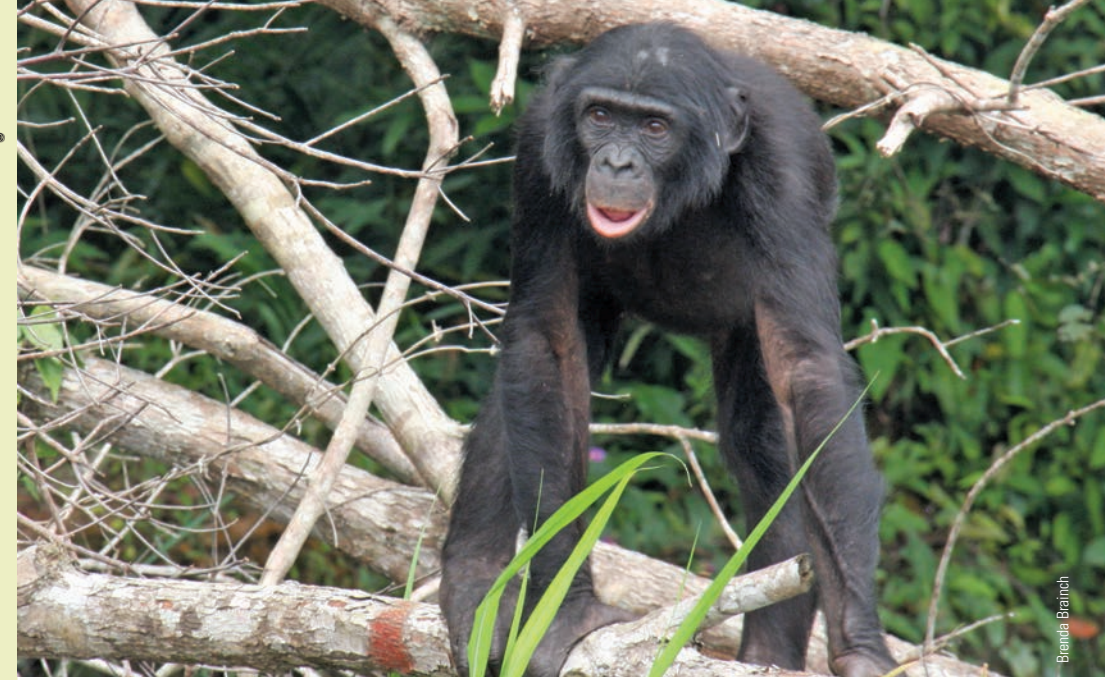
After seeing the community benefits arising from the Lomako–Yokokala Faunal Reserve, members of the lyondji community requested protection for their bonobos and forests.