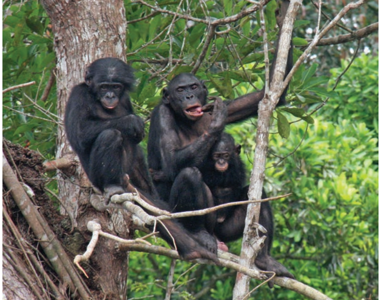
In the new lyondji reserve, AWF hopes to implement scientific surveying and monitoring to determine the bonobo population there.

Located in the same landscape as the Lomako Reserve, which AWF helped establish in 2006, the Iyondji Community Bonobo Reserve adjoins the Luo Scientific Reserve, where the most famous bonobo research site—Wamba—is situated and operated by Kyoto University. Together, Lomako (3,625 sq. km), Iyondji (1,100 sq. km), and Luo (500 sq. km) will conserve wildlife and forest resources that have come under increased pressure from hunting and agriculture.