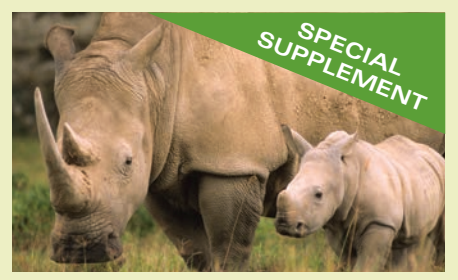
Africa wouldn't be the same without rhinos...