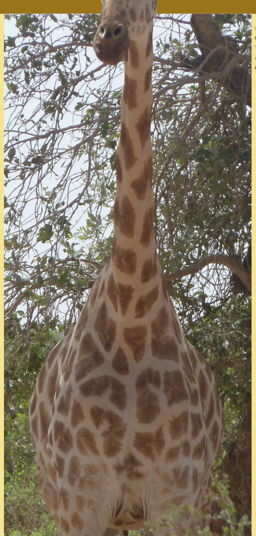
AWF will soon assist in the annual West African giraffe census in the Regional Parc W Heartland. Census results, as well as a proposed monitoring project, will help AWF and its partners determine how to protect the giraffe's habitat, which has suffered rapid degradation

With the government of Niger expected to reinstate its National Giraffe Conservation giraffes' ranging patterns. AWF has begun AVEN, and local universities to potentially