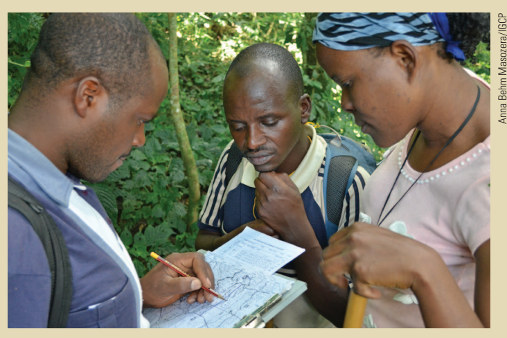
Team members review the map of Bwindi Impenetrable National Park in Uganda and plan their next reconnaissance trail.