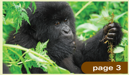
Another mountain gorilla census?!