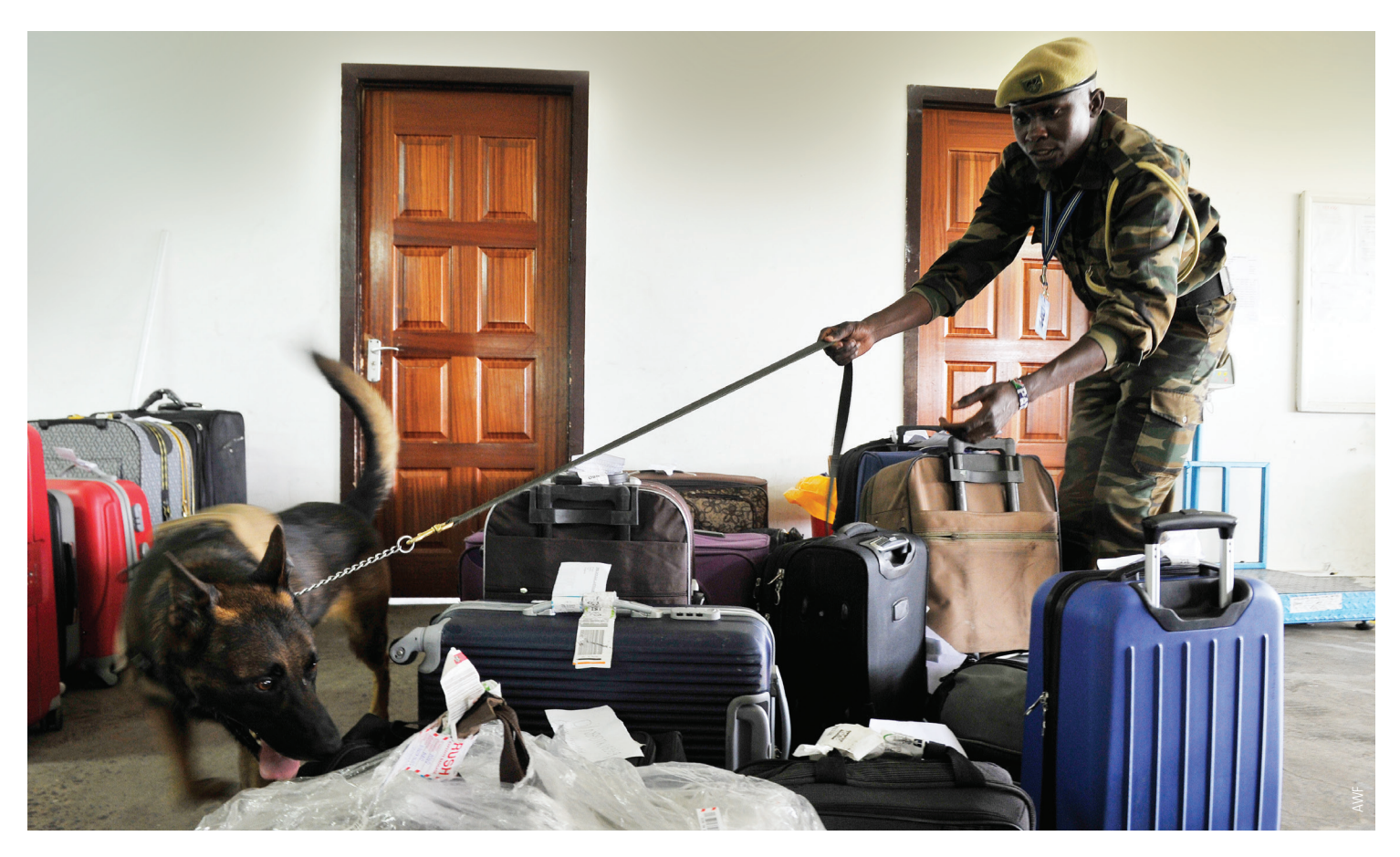
Between January and July of this year, the AWF-trained teams had made 26 busts, the majority at Nairobi's Jomo Kenyatta International Airport. Amongst the biggest finds has been 65 kg of ivory, but the detection dog teams have also found smaller amounts of pangolin scales and ivory trinkets.