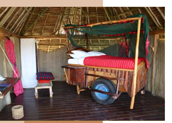
The StarBeds® Ecolodge provides a unique experience for tourists visiting the region and allows the community to benefit from tourism revenues.

Koija Starbeds® has helped demonstrate that the enterprise strategy, by providing tangible benefits to support community livelihoods, can be successfully used to secure critical wildlife lands for conservation.