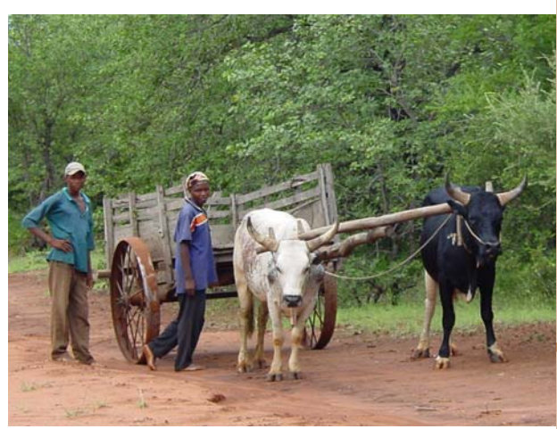
The Cubo community has set land aside for conservation, hoping to benefit from tourism revenues.

AWF is now providing more support to the community to develop the reserve into a viable concern for long term conservation and enterprise management. An application has been submitted to the government for the allocation of an additional 41,000