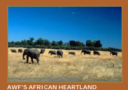
PROGRAM AWF focuses on large conservation landscapes that are viable ecologically and economically.