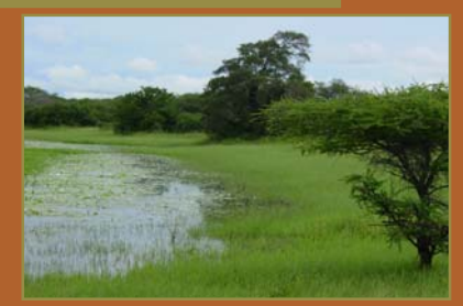
CUBO COMMUNITY IN MOZAMBIQUE AWF helps the Cubo Community acquire land rights and develop a community reserve.