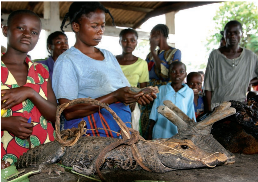
LEFT: Bush meat has long been considered a ready source of protein for rural populations, but it has steadily become a more commercial business to appease appetites for “wild,” rather than domesticated, meat.

Ultimately, it may come down to land-use planning, or zonation, to ensure sufficient space for human activities and for wildlife. Such plans allow for appropriate development while limiting sprawl. With perseverance, AWF’s combination of working at the government policy level and on the ground will result in big wins for wildlife and wild lands. In the meantime, AWF will continue to work, every day, on those “everyday” conservation issues affecting Africa. ■